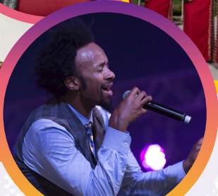
3 X GRAMMY Award winner: Fantastic Negrito